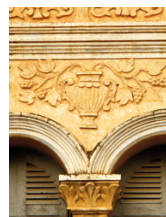
Shop House Detail