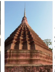
Stupa Wat Kamphaeng